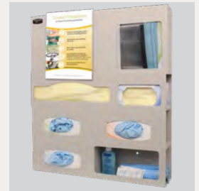
PS016-0212 with MP-047